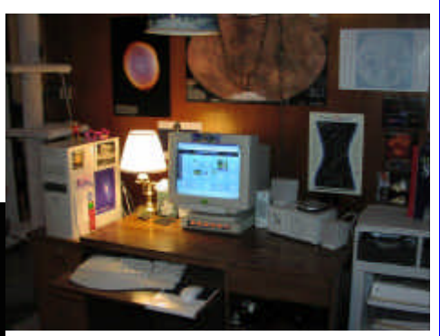
Star Girl's Bridge