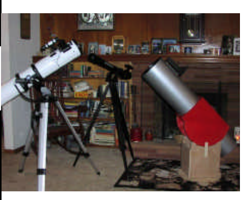
Star Girl s MEAD DS-127EC Scope and her 8-inch Dob